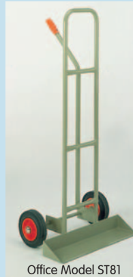
Office Model ST81