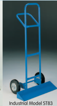
Industrial Model ST83