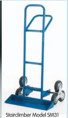
Stairclimber Model SM31

New Product, designed to meet customer's need