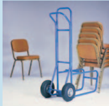
Alternative support designs available